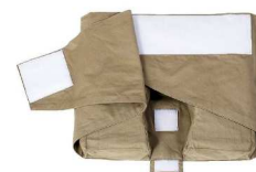
The Cover Sheet

Connect the cup unit to the hose. Lay the cover under the body, attach the cup unit and stabilize it with the cover sheet.