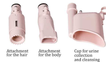
Attachment for the hair

The three cleansing attachments—for the hair, body and the cup for urine collection and cleansing—are part of breakthrough cleaning system that conduct sucking while washing, preventing water leakage.